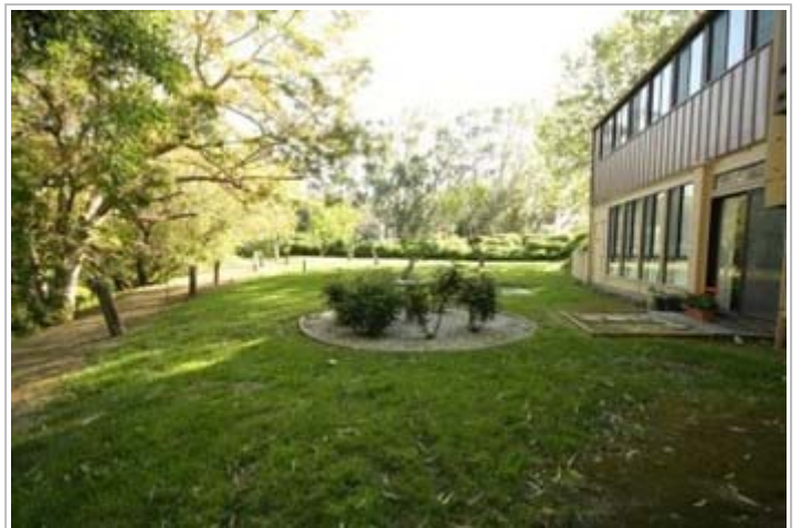
Common outside area