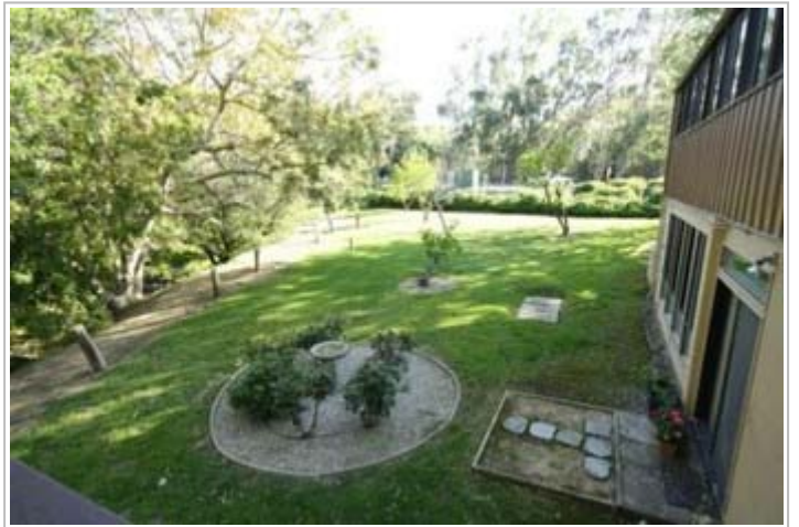
Common Outside Area